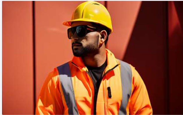
High-Visibility Vest & Coveralls

Robust footwear with reinforced toe caps to protect workers' feet from falling objects and heavy impacts on construction sites.