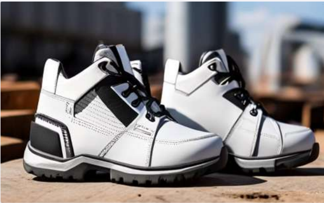
Steel Toed Safety Shoes

Robust footwear with reinforced toe caps to protect workers' feet from falling objects and heavy impacts on construction sites.